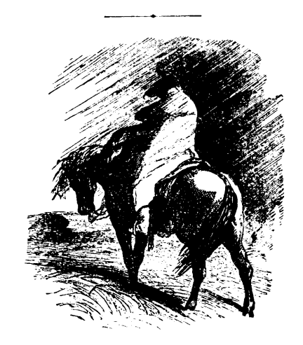
From the "Sunday-School Almanac."

It is to teach such poor men the truth, to save millions of children from growing up in such silly beliefs and from feeling such needless torment that we send missionaries to the heathen. Let us thank God we were not born heathen! Let us do all we can to send missionaries to instruct and save those who are in such darkness!