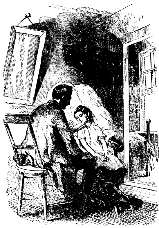
THE DOCTOR VISITING EVA.