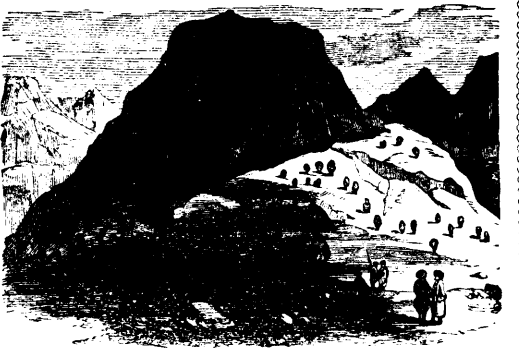
and make them joyful in my