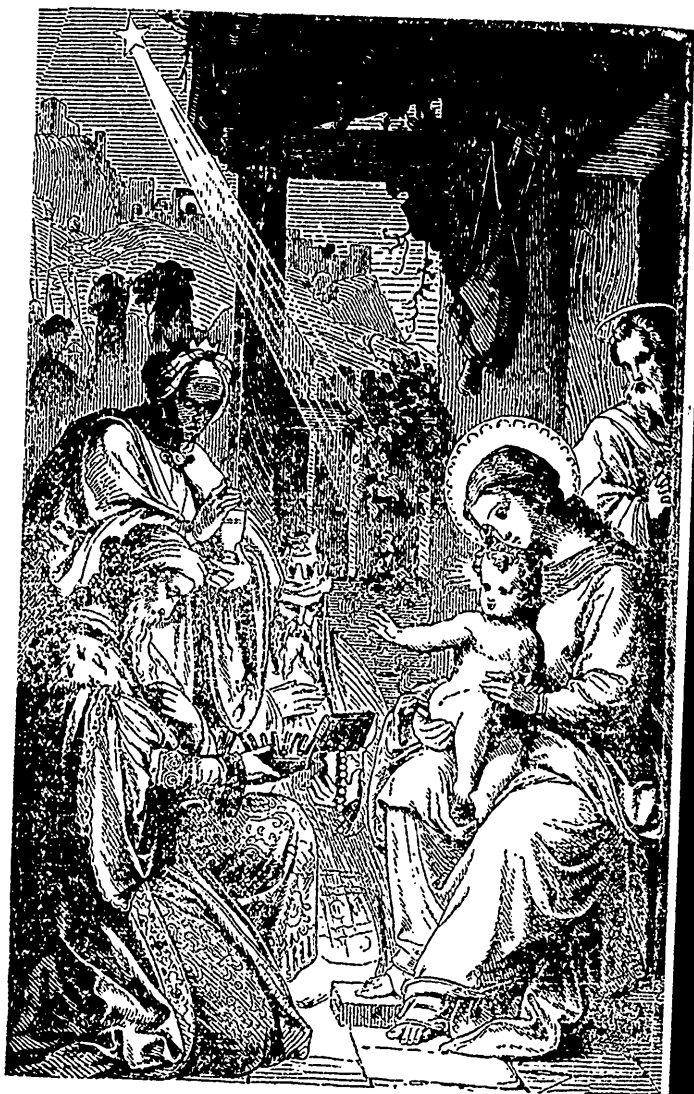
ADORATION OF THE MAGI