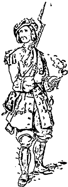
One Militia-man of the Flying Camp

After fifty days of such perilous navigation, through rapid and dangerous places, Father Ragueneau had at last the happiness of bringing his people to the promised land of Quebec on the 28 th July 1650 (1).