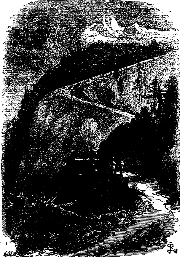
HORSE ROAD OVER THE ROCKY MOUNTAINS.