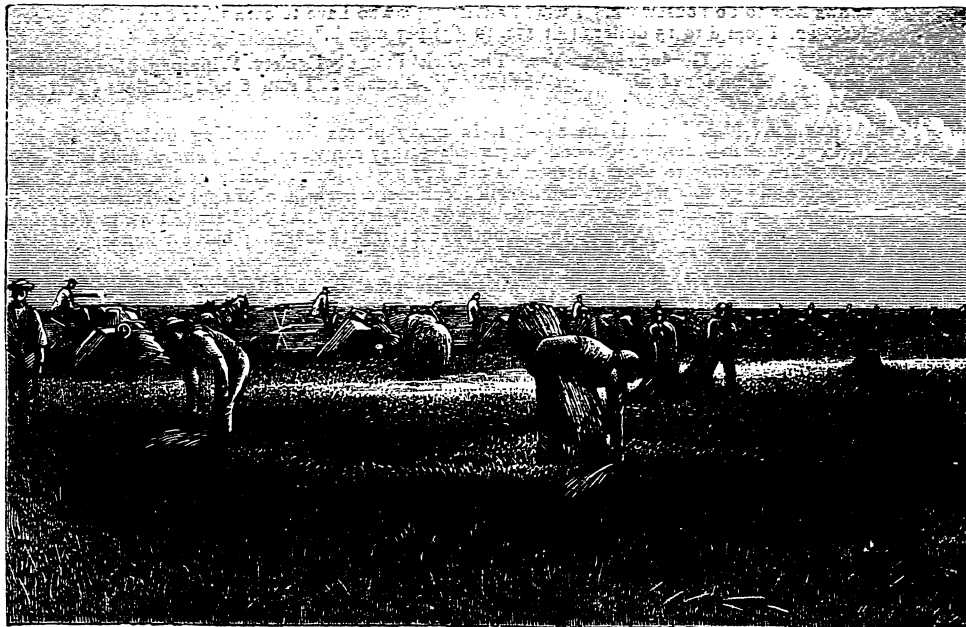
HARVESTING ON THE PRAIRIE, QU'APPELLE VALLEY, N.W.T.