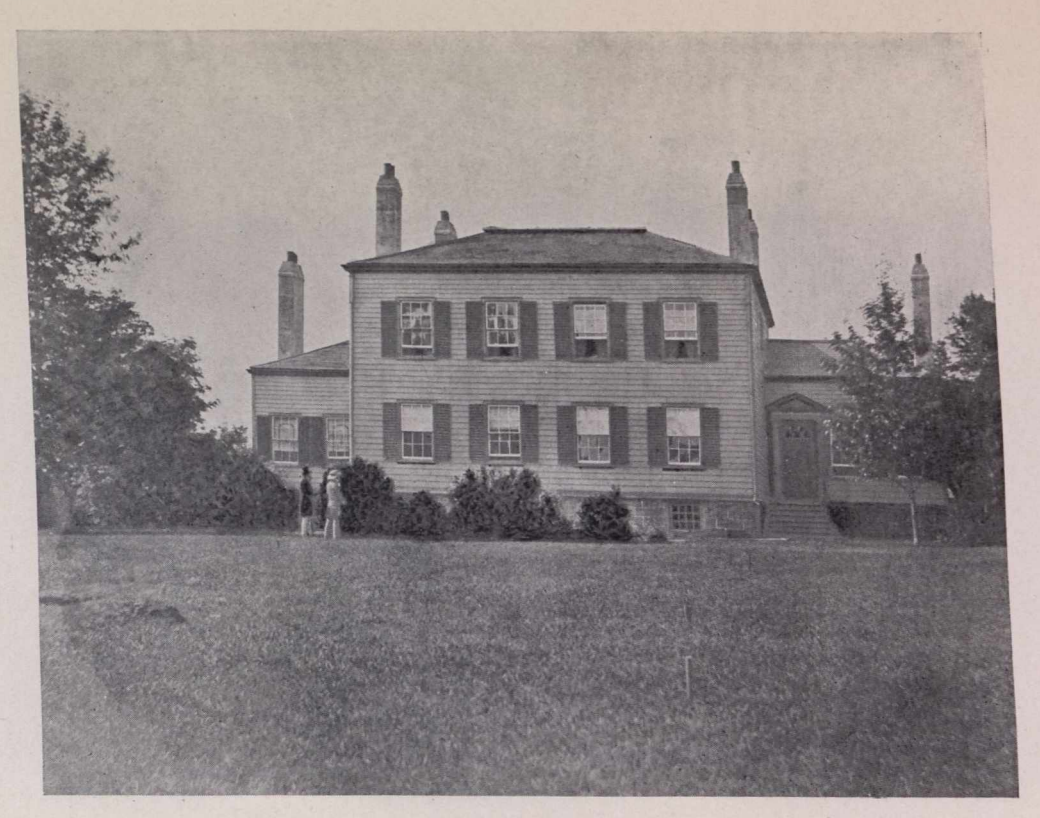
THE OLD CHIPMAN HOUSE-ERECTED A. D. 1787.