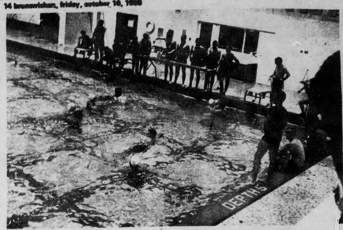
Sir Max Aitken Pool has been the scene of many water sports, and this year the UNB Beavers and Mermaids are trying again in the same sporit that won them last year's Maritime title. Oh Yeh, this isn't a swim team practice, it's the nurses playing water polo against the foresters.