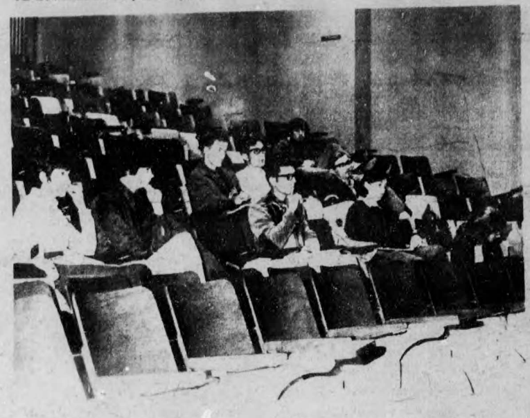
The Arts Society had another organizational meeting. The attendance was better for this one. There were nine more who turned out. Shown here somewhere in the audience is the extra nine interested artsmen.