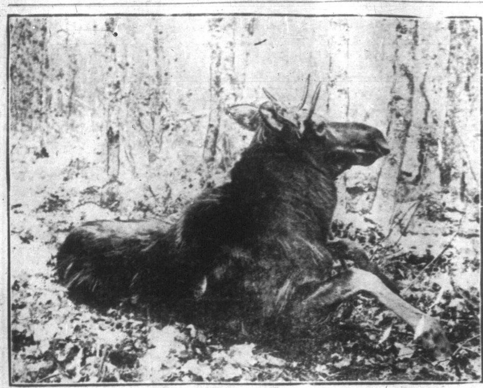
His lordship disturbed. A young Nova Scotian bull moose preparing to move as he hears the hunters' approach.