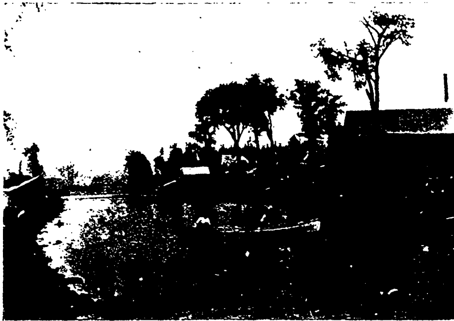
TEMISCAMINGUE MISSION—WABIE RIVER AT THORNELOE.

Now is the time to lay foundations. Much has been done already for which we must needs be thankful. At Thorneloe we have a neat wooden church, as yet un-