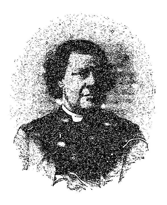
Lietzch trus er amfannk bese tie Abentreit