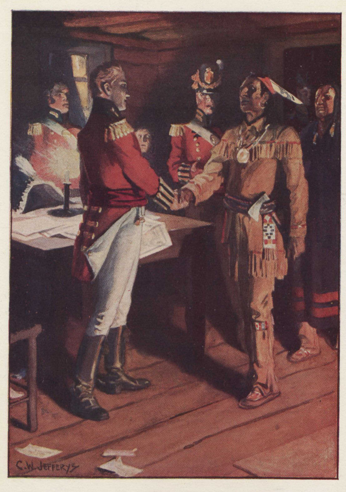
THE MEETING OF BROCK AND TECUMSEH From a colour drawing by C. W. Jefferys