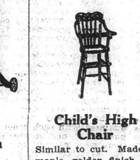
Similar to cut. Made of maple, golden finish, flat wood seat has sten, is very strong and service able; price ......$2.00 We also have a large bler seat, high back, top piece embossed; price. seat, embossed back; price .....$2.50 we also have a le stock of other back of other back; price .....$4.00 chairs at all prices. stock of other high