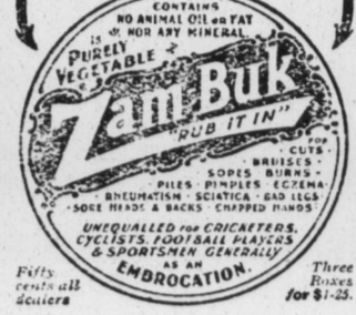
Fifty cents all dealers Three Boxes for $1.25

A dressing of Zam-Buk takes out all fiery pain and soreness. It ensures your burns healing quickly and perfectly without festering or disease infection. The secret of Zam-Buk's wonderful healing, soothing and antiseptic power, lies in the blending of certain rich essences whose effect hastens Nature's own healing. Zam-Buk is 100% medicine. It contains none of those animal or mineral impurities which are met in common salves and ointments. As a "first-aid" for injuries, and as a remedy for eczema, ringworm, ulcers, and other obstinate skin diseases Zam-Buk is absolutely reliable. It's the purest and most valuable healer in the universe.