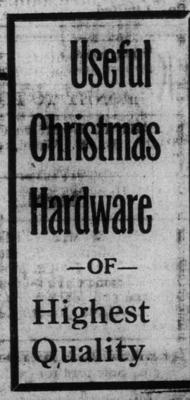
Table Cuttery, Pocket Knives. Safety Razors, Shears and Scissors, Case Carvers, N. P. Copper Tea and Coffee Pots, Percolators, Casaroles, Carpet Sweepers, Etc.

Seven of the nine officers who rebeen notified to report at Halifax next month to accompany a drait