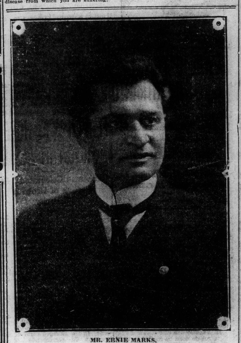
Whose Company are playing all week at the Grand Opera House,

may warrant, however, you may rely on the quality of "SALADA" remaining exactly the same as ever. in Use For Over 30 Years Unimpeachable—It you were to see the unequalled volume of unimpeachable testimony in favor of Hood's Sarsaparilla, you would upbraid yourself for so loug delaying to take this effective medicine for that blood disease from which you are suffering.