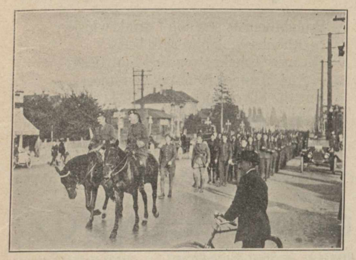
THE BATTALION ROUTE MARCH-The O. C. and Adjutant at the head of the column

Excuse the exultation, but the Machine Gun Section desires to call attention to its conduct. No absentees, no crime, nothing wrong to date. Some record.