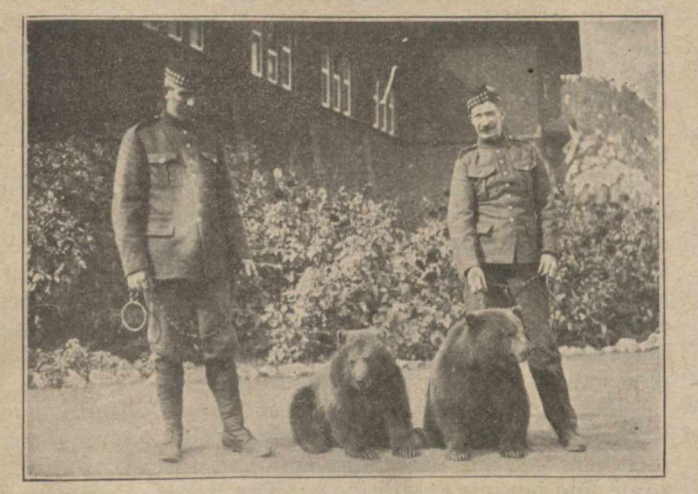
THE REGIMENTAL MASCOTS-The two Grizzly Cubs and their Guardians from Prince George

After an admirable musical programme, an impromptu "hop" was organized, and the soldiers