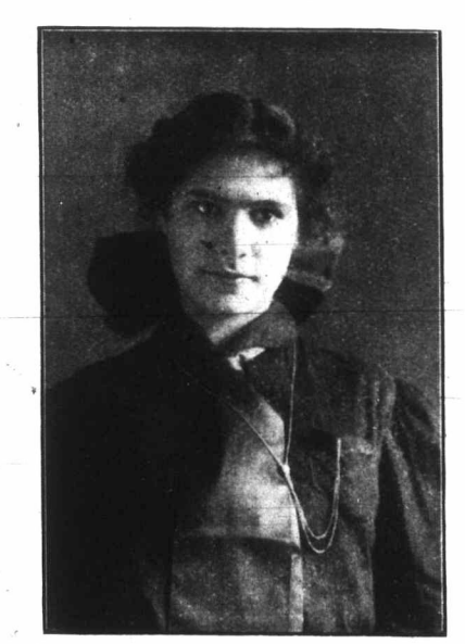
Half-breed girl brought up at Mission.

shiver you enjoy, while feeling that you have a strange resemblance to a bear with your shaggy coat, and eye-lashes thickly fringed with icicles, you cannot help laughing, and are ready, in spite of all, to thank God that you are alive. And it is not only the air that suits you, the prevalence of sunshine is itself a blessing; not but that within the Arctic Circle one loses sight of his solar majesty for some weeks, and even on Lakes Bennet and Atlin, and down the Yukon to Dawson, the sun disappears in winter for a time behind the mountains, but it reappears again early in January, and in the meantime it is not dark as in the land of the midnight sun, but only a gloaming, and lighted up by the fair moon of the north, which, by a merciful Providence, is above the horizon for nearly twenty-four hours when