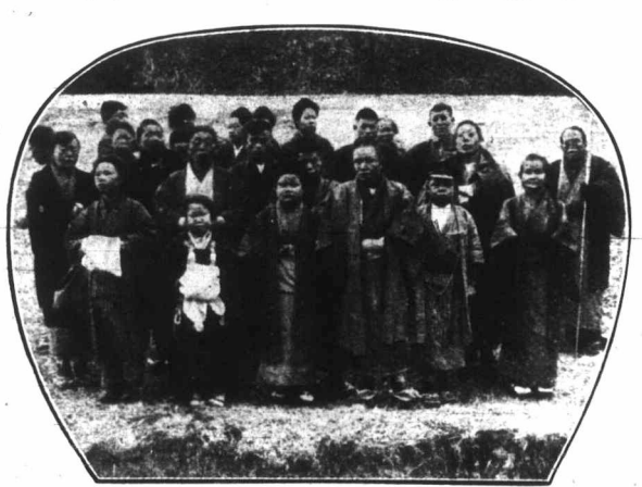
The Members of the Christian Endeavour Society, managed entirely by the patients themselves.

be moved to give herself to this most happy and blessed work for even one or two years. The number of patients in the Hospital grows steadily upwards. There are now fifty-one occupying the space allotted to forty, and very greatly congested are we for room. The number of requests for entrance which come in every week and have to be refused or postponed is simply heart-breaking, and I am using every endeavour to double the accommodation of the Hospital, and also to endow it, so that it may ever continue its spiritual and medical work without being a burden upon the resources of the Church of Japan to which it will eventually belong. Allow me to give, in brief, a typical application for entrance recently The writer states that he is 28 years old and has been a leper for seven years. He says that for the last few years he has been receiving medicine from the Hospital by parcel post, for which he has always sent money, but that now his friends consider it is not worth while to spend any more money upon him, and he writes to know if I will allow him to have medicine in the spring and autumn, which are his worst times, without it being paid for. And he asks if he may have a little ointment for his nose at once, for he is suffering greatly with it. He says that since last November he has not been allowed to live in the house; that until then he lived in one of the large cupboards which exist in all Japanese houses for bedding, 6 x 6 x 3. (I