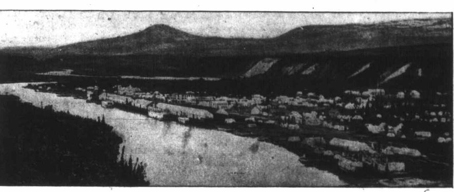
White Horse at the Hour of Midnight.

other race with whom you may be placed-it is the power of influence; it is woman's strongest, most prevailing weapon, too, as the pages of history have shown, and our daily records make manifest. It has swayed the destiny of kings, it has turned the course of events as truly as the helm turns the course of the ship. It is dangerous, because it often works strenuously but unsuspected. You are going among a people unsuspicious of evil; -may the power which God has given you be exercised for their good, and not their injury. In your Christian households, in your modest demeanour, in your fair dealings with all, let them see what they should seek to copy more than the jewels and costly attire which in their eyes are all that is needed to constitute a lady. So will the Indians' country grow and prosper, not only from the wealth of its gold mines, but also from the refining, permeating influence of its Christian gentlewomen.