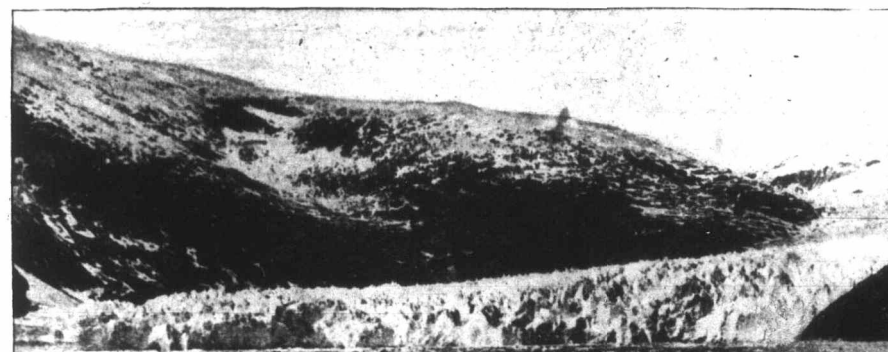
Taku Glacier, Alaska.