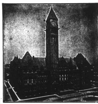
TORONTO CITY HALL

the minister as he read the service. Mechanically she opened her hymnal at the right place, but she did no sing. She was mourning, not rejoicing, this lovely Thanksgiving Day. The people sitting in the pews, to her, were those she had loved, and who were now gone above. She could see her grandparents, father, mother, uncles, aunts, and friends, old and young, occupying the old places. Again, the scene changing, she recalled the many "last times" they had each been in that