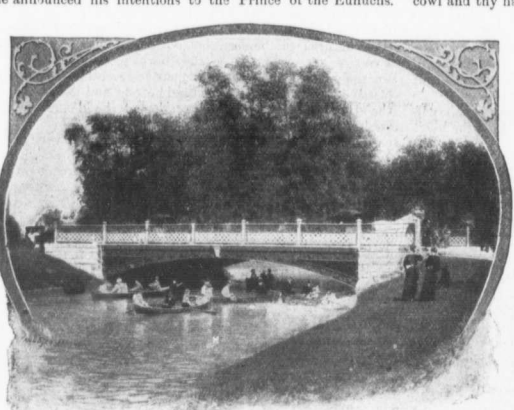
CENTRAL BRI. GE, BELLE ISLE PARK

3. Having reached a decision, make haste to carry it out. "The flighty purpose never is o'ertook except the deed go with it." Begin now. Break soil at once. Daniel purposed in his heart that he would not defile himself. Straightway, he announced his intentions to the Prince of the Eunuchs.