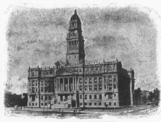
WAYNE COUNTY BUILDING, DETROIT,

DECISION is the basis of character. The power to promptly and firmly choose aright is the guarantee of moral safety. Trite, but true, is the old proverb, "The man who hesitates is lost." He who would respect himself, or be respected by others, must save himself from the habit