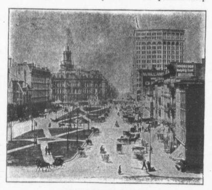
CADILLAC SQUARE, DETROIT. Showing the City Hall on the left and the Majestic Building on the right,

THE City of Detroit was founded by Cadillac, and his followers, in the year 1701, and is the oldest city on the chain of Great Lakes. It is situated on Detroit River—de troit being French for strait—eighteen miles above its entrance into Lake Erie. It has a population of over 350,000, many of the descendants of the early French settlers being residents to day. With the possible excep-