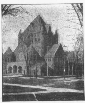
FIRST PRESBYTERIAN CHURCH, DETROIT.

"WHAT harm is there in it?" says the young man, as he puts up five or ten dollars on the races. "Whose business is it?" inquires the youthful speculator, as he risks a week's wages in a bucket shop. "May a man not do as he likes with his own?" demands the jolly good fellow,