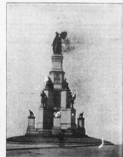
THE SOLDIERS' MONUMENT, DETROIT.

and here is increasing. If the spirit of the Christian Church in this age may be by one phrase distinguished from some preceding ages that phrase is "A living Christ," an overshadowing never-absent Jesus whom we serve and whom we love. We are escaping the worship of creeds—the idolizing of denominations and adoration of the Book. We are surely becoming conscious of the Christ. This explains the marvellous avidity with which all