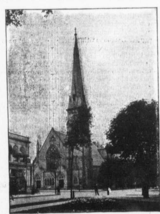
CENTRAL M.E. CHURCH, DETROIT.

In referring to the importance of having the Bible read in the Public Schools of the United States, Leslie's Weekly says: "There is nothing that the American people stand so much in need of today as they do of a larger measure of genuine spirituality, a deep and abiding religious faith in the shaping of character and the control of conduct. No greater calamity could possibly happen to the American nation than the casting out of the Bible from the life and