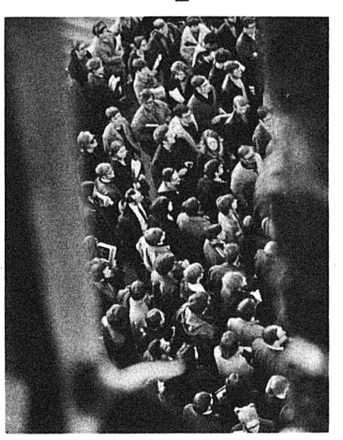
AND AT U OF A ... a pooling of apathy?

Peace vigils, teach-ins and orderly marches are planned across the U.S. as activities designed to show opposition to the war, and several major