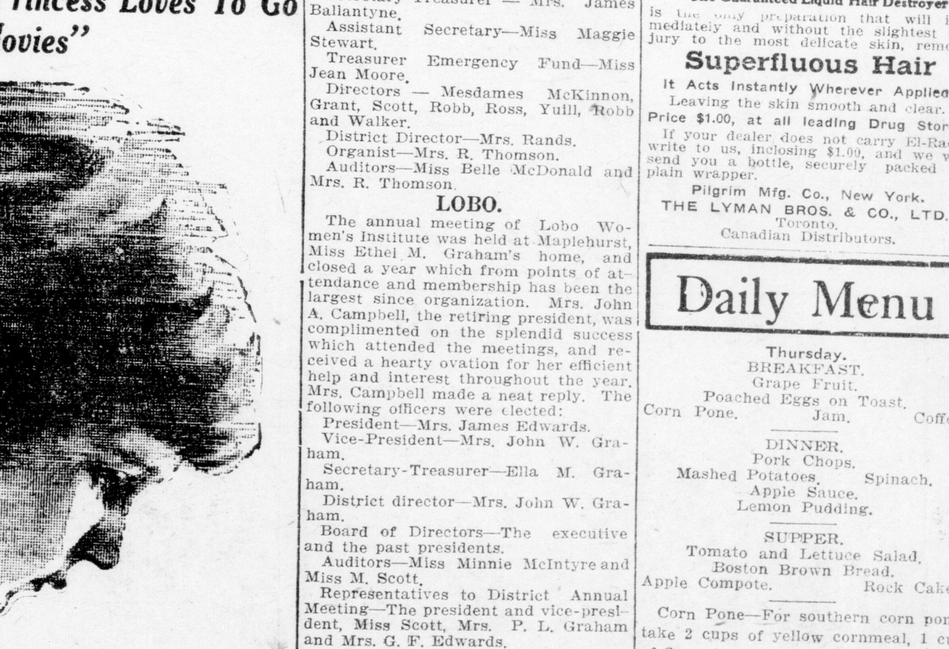
PRINCESS ILEANA OF ROMANIA. BY AUNT GERTIE.

Boys and girls, how would you feel if you suddenly found out that you were sitting RIGHT NEXT to a REAL, LITTLE PRINCESS in the nickel show? Oh, my, how your hearts would thump, and how you'd like to turn away round sideways and look into her face, especially if she were very, very pretty. Well, now I'll tell you. There IS such a real Princess in the world who goes to the "movies," oh very often, just because she likes to see them. Her name is Princess Ileana. She's the youngest daughter of the Crown Prince of Rumania. This lovely little girl was born Dec. 23, 1908. So you see she is nearly five. Her mother is the Princess Maria, who has been called the most beautiful princess in all Europe. Little Ileana has wonderful violet eyes. She knows a great deal for a little girl. Though she lives in Rumania, she has English nurses so that it will be very, very easy for her to learn English, you see. But, of course, she will be taught English when she goes to school. You know nearly everyone who can afford it in foreign countries teaches their children English as well as their native language.