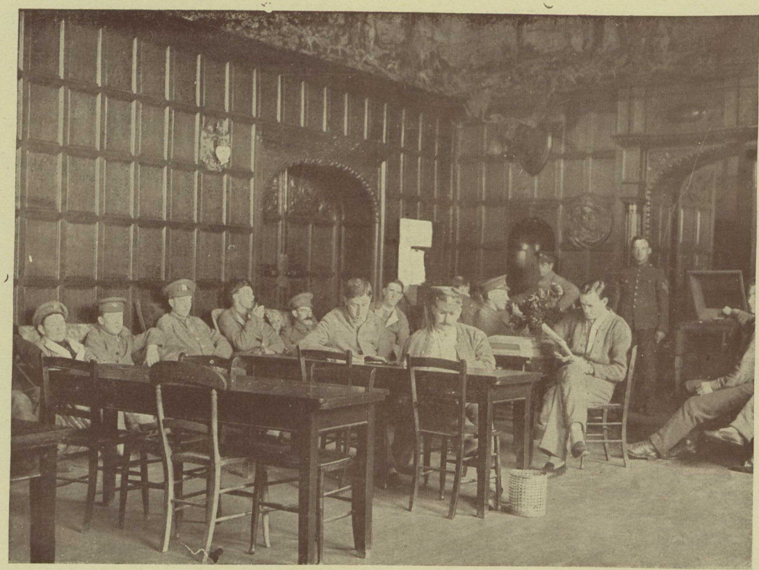
EVENING AT KINGSWOOD.