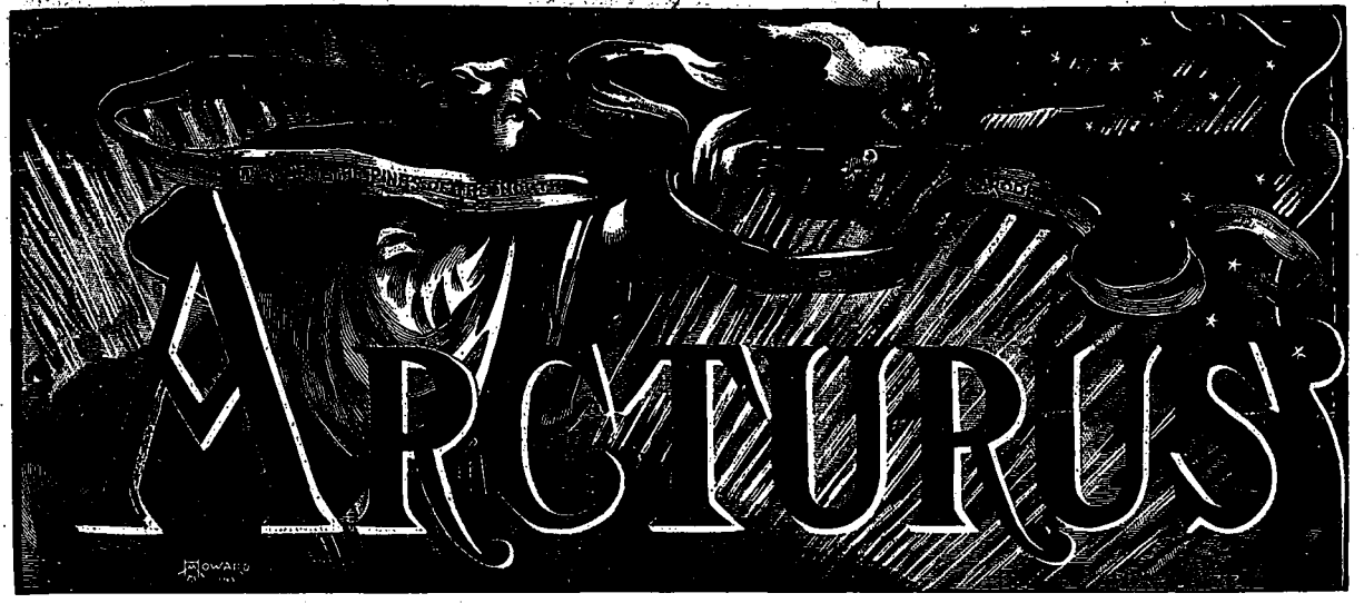
A CANADIAN JOURNAL OF LITERATURE AND LIFE