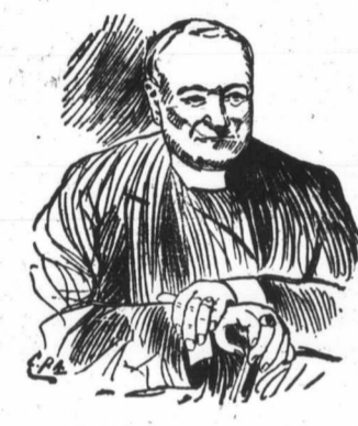
EPISCOPAL PRIMATE OF ALL IRELAND.