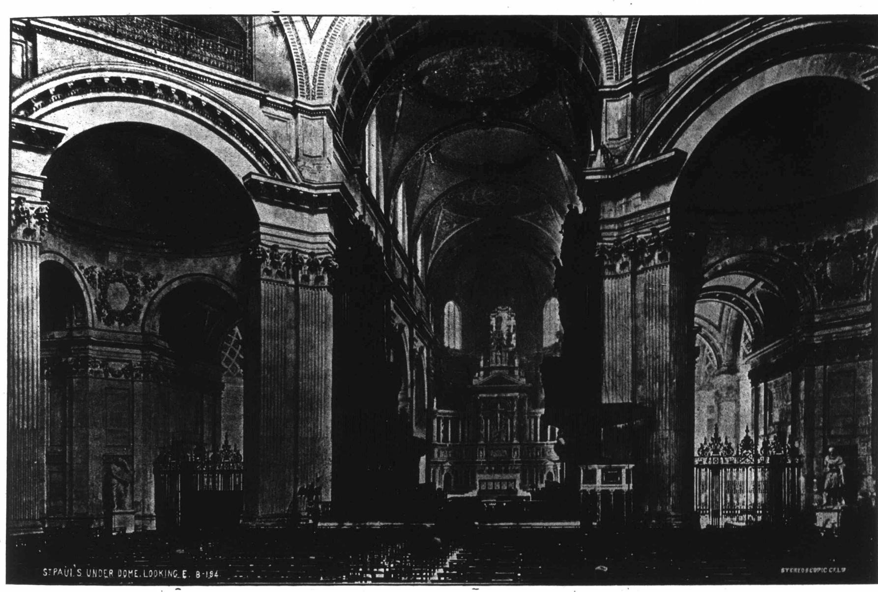
Under the Dome, St. Paul's Cathedral, London