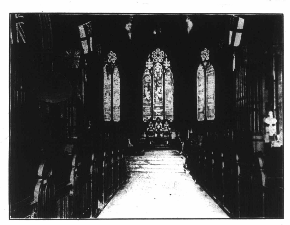
Interior View of St. James' Cathedral, Toronto

St. Paul's Cathedral, London, and St. James' Cathedral, Toronto. on August 4th, were simultaneously the scenes of a solemn demonstration of the united purpose of the British Empire to continue its warfare against Teutonism until liberty and justice are vindicated.