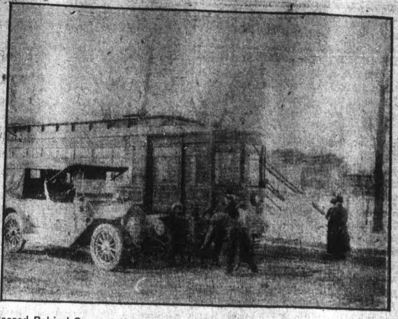
Passed Behind Car. Knocked Down by Auto. Look Before You Step.