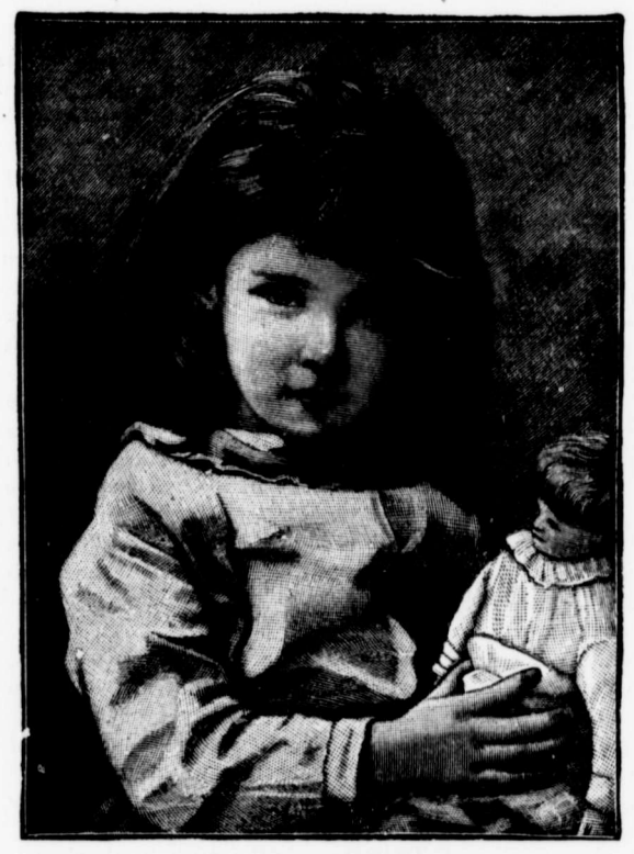
" A beautiful new doll in her arms."