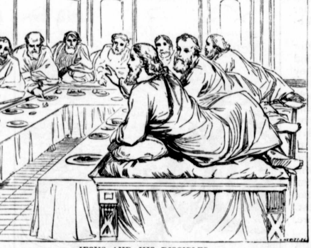
JESUS AND HIS DISCIPLES.

In John 15: 5 He says, "Without Me ye can do nothing." 3. The vine gives fruitfulness. But to be fruitful, a branch is to remain in the vine. If it is broken off from the vine, it will bear no fruit, so we can bear no fruit-do no good works-unless we abide in Him. You know. dear children, that men care very little for a vine unless it bears fruit. Now, to be useful, to do good to others, is the greatest of all privileges. It is to