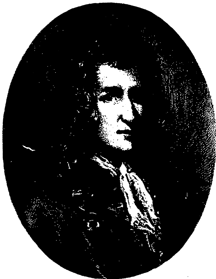
ROBERT CAVELIER DE LA SALLE