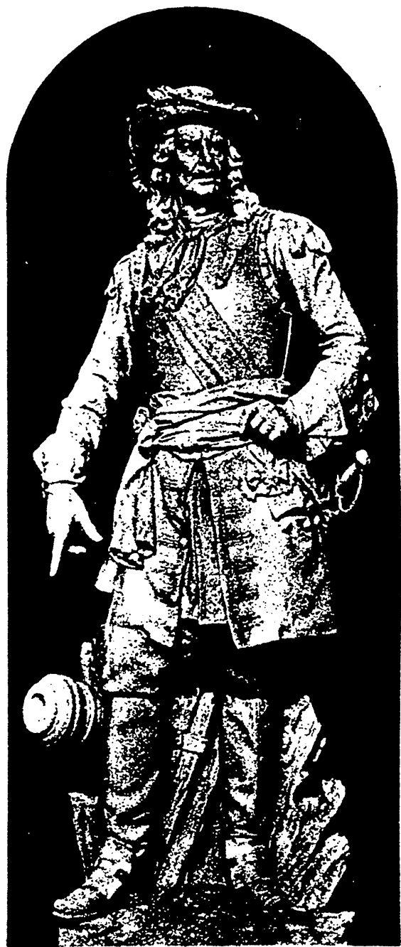
FIGURE OF FRONTENAC