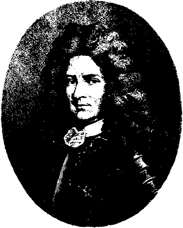
PIERRE LE MOYNE, SIEUR D'IBERVILLE

From an engraving in the John Ross Robertson Collection, Toronto Public Library