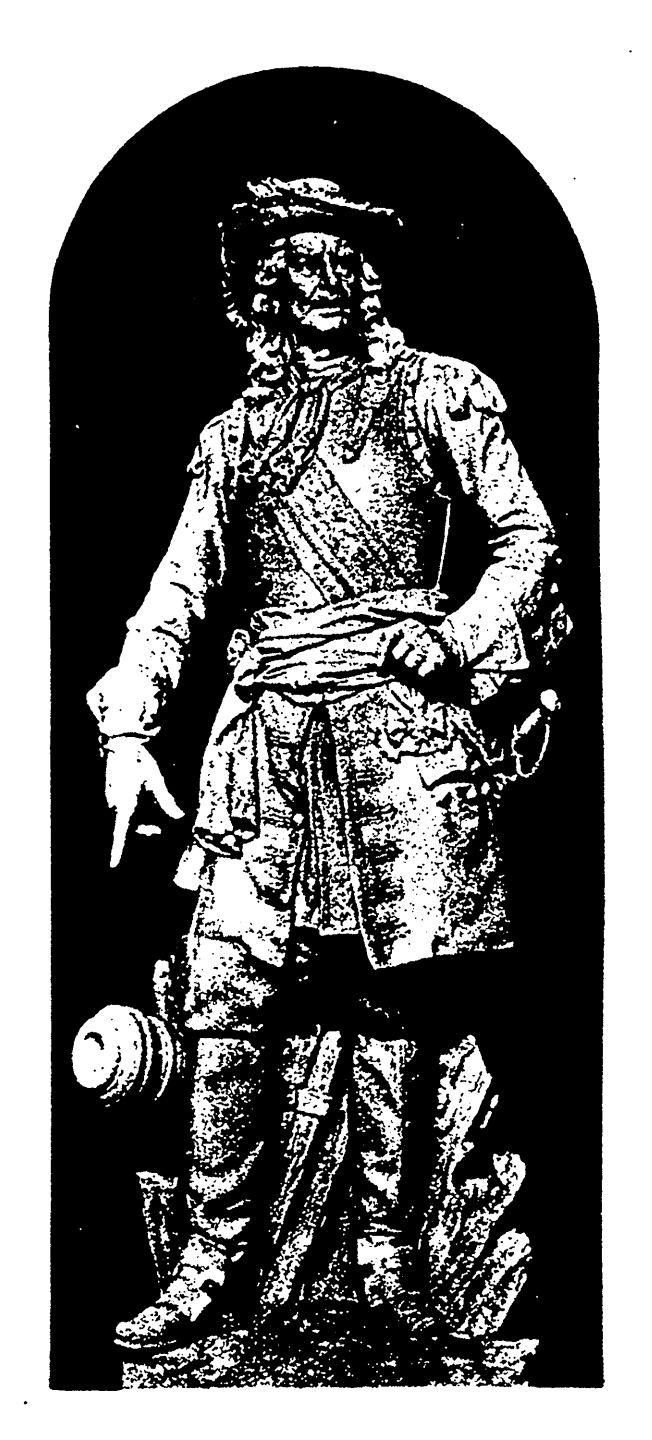
FIGURE OF FRONTENAC From the Hébert Statue at Quebec