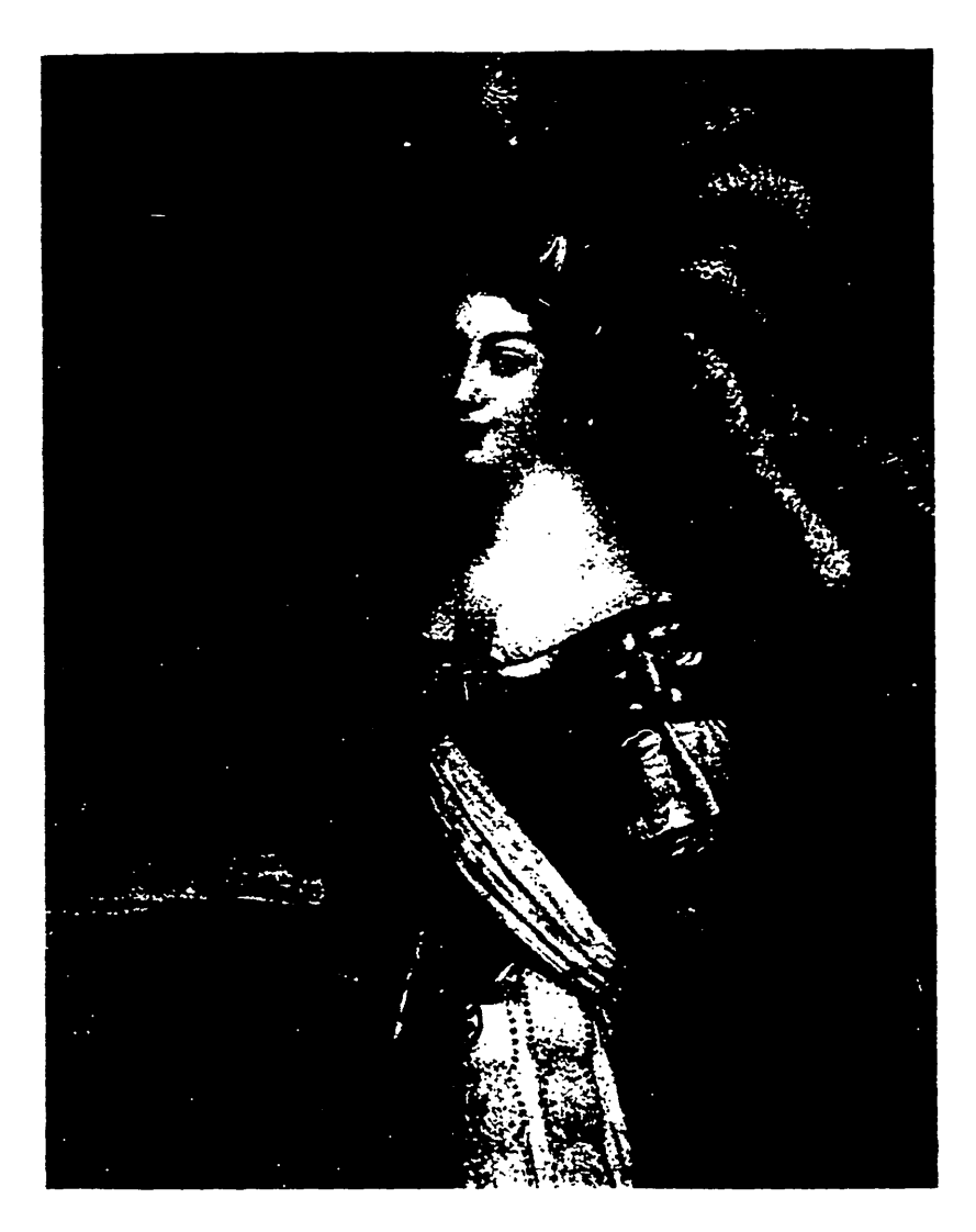
LADY FRONTENAC From a painting in the Versailles Gallery