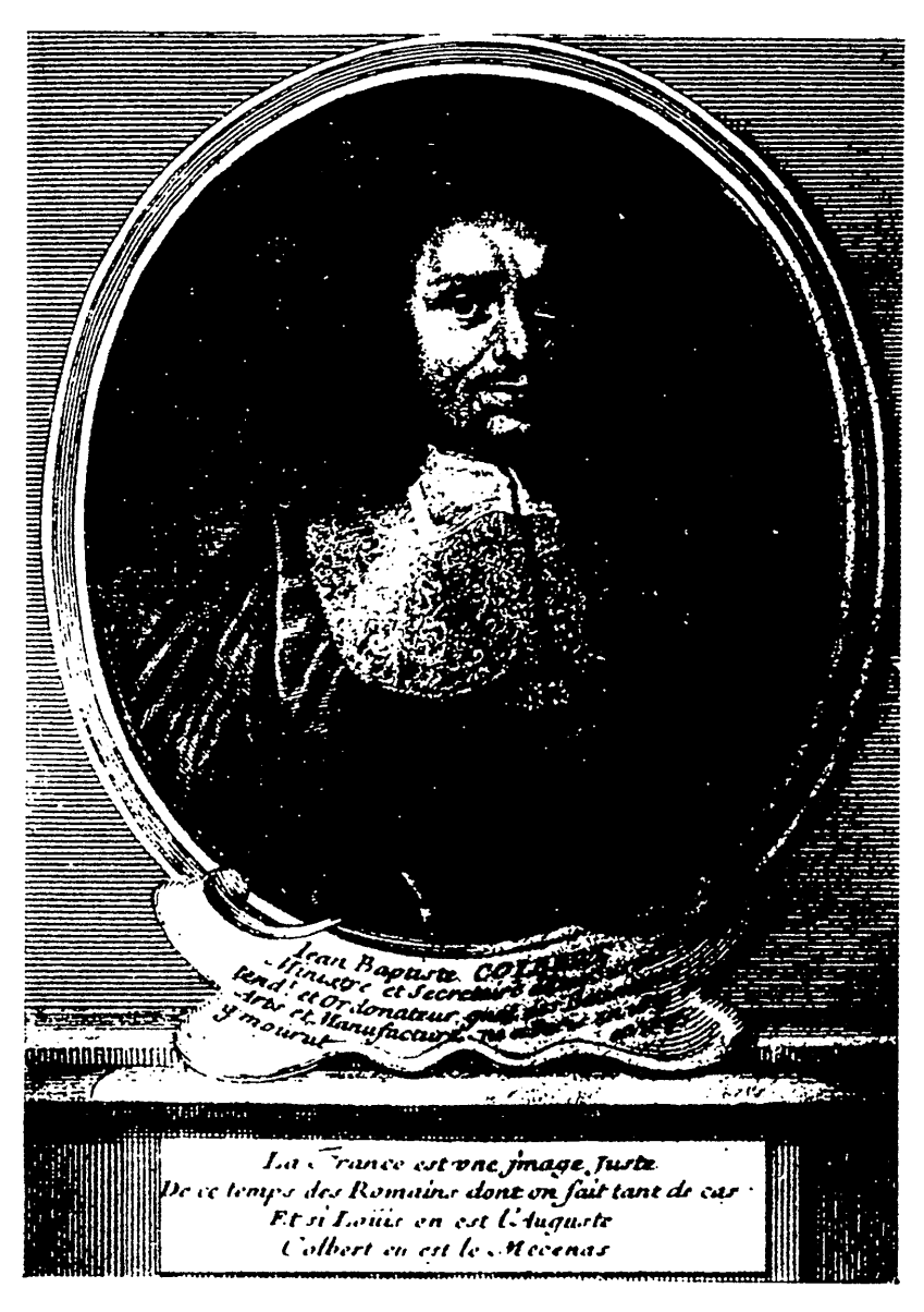
From an engraving in the Château de Ramezay