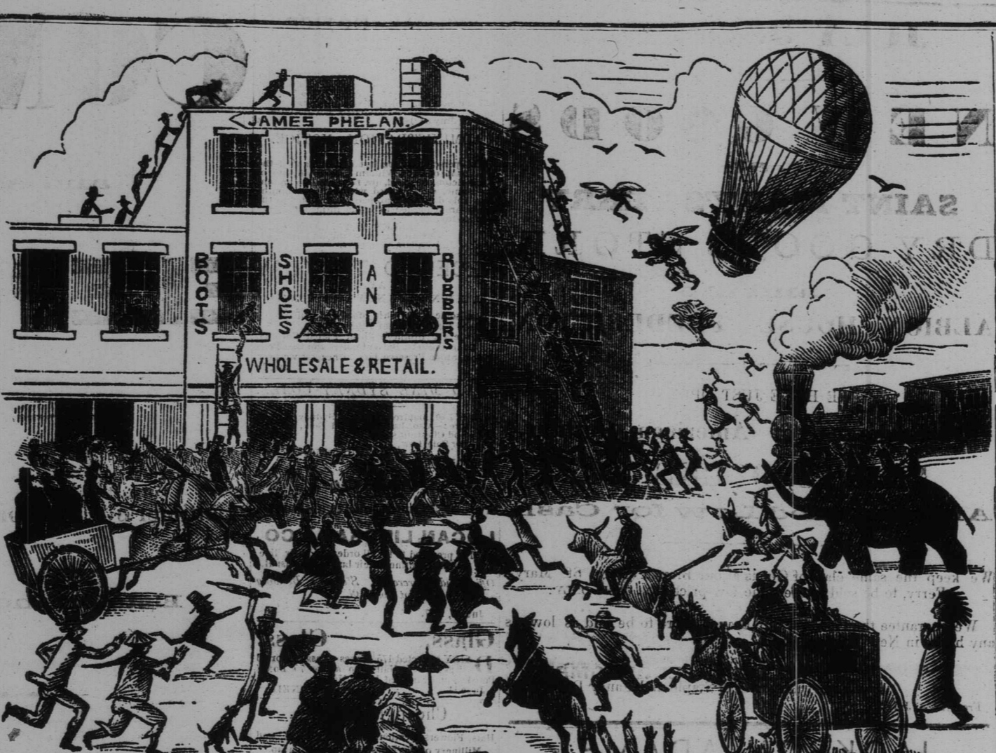
The above will but faintly illustrate the great rush we expect to greet the announcement of our Monster Clearing Sale of Boots and Shoes!!!

It was not hard, I think, to fix Their eyes solely from time's tricks, Without the "Six and Seventy-six," "Mama and Grandmamma," side by side, And seventy years betwixt them glide.