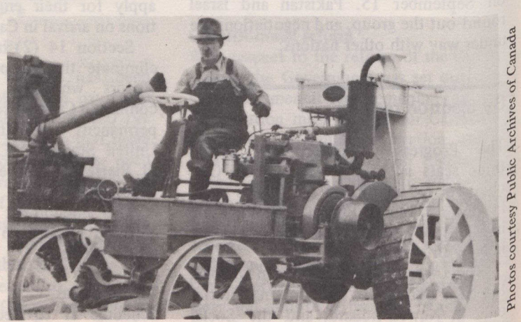
These scenes and implements were familiar to pioneer farmers who welcomed advances like the first gas tractor (lower right).