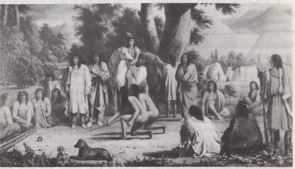
Game of Al-kol-lock, oil on canvas by Paul Kane.

Overland journeys to Canada's Pacific coast before the days of settlement were arduous, tedious and dangerous. The exhibition The Canadian West: The Land and the People re-creates these lonely nineteenth-century travels with a series of oil paintings, watercolours, sketches and prints. The display, which runs from September 15 to January 21 at the Royal