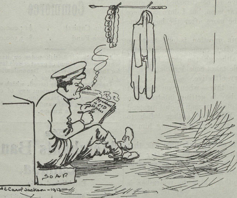
Songs We Know:—(6)—The Bedouin Love Song, “Till the sands of the desert grow cold!”

same camp as the engineers but do not form part of engineer services; and are attached only to the O. C., Canadian Engineer Training Depot for discipline and rations.