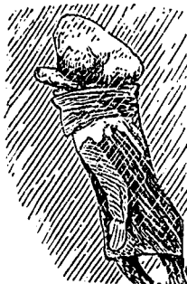
On a youth from the country.