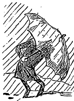
On an Editor.