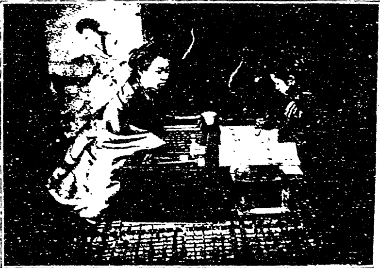
A WRITING LESSON — NATIVE EDUCATION.