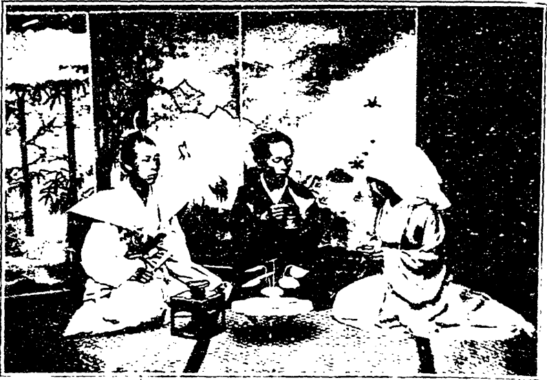
HUSBAND. GO-BETWEEN. BRIDE. A JAPANESE MARRIAGE CEREMONY.