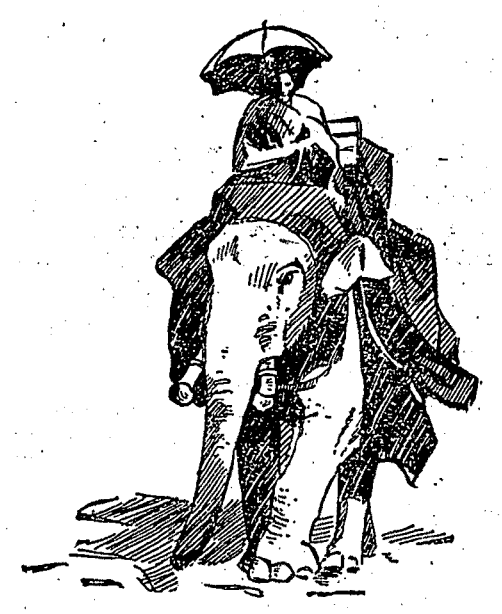
ELEPHANT RIDING AT JEYPOOR.

It is, perhaps, unfortunate that telegraphy in India is cheap, for the custom is to wire the station master to fill every emergency, from holding a car for a party, securing rooms at a dak, engaging rickshaws, furnishing meals, to receiving letters addressed to his care. A hundred demands are made upon his time and patience, which would never be dreamed of or tolerated anywhere else. These good Samaritans are generally Britishers or half-castes in all the central provinces, but in the south, the native Baboo, much alive to the importance of his post, is not apt to be so obliging, but shows an overwhelming curiosity in your affairs, which interest does not extend to properly labeling or receipting for your luggage. Of the