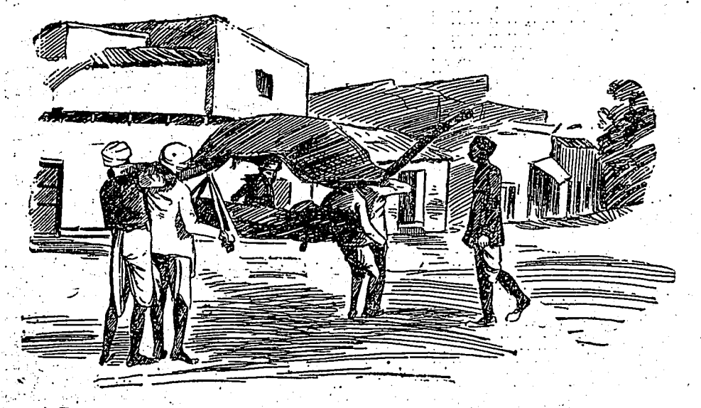
A COMMON MODE OF TRAVELLING IN INDIA.

The holder of four tickets is entitled to a whole car, the main saloon being about 8x11 feet, with a lavatory at one end, which sometimes includes a shower bath, and on some lines a small, communicating compartment is provided at the other end for the servant. This car can be side-tracked anywhere, without extra expense, by notifying the station agents in advance. Four windows run along each side of the carriage, beneath which are leather covered seats that can be pulled out to a three-foot bed at night, and other couches can be pulled down from the top if required. Any elegance of appointment would be useless, as the tracks run along the endless sandy plains, so that the dust filtering through every crevice is a nostalgic reminder of similar experiences on the Long Island Road. A boarded screen, two feet. deep, projects from the roof of the car over the windows, to form a shelter from the direct rays of the sun; shutters are also provided, and every alternate window is blue or green glass, which, during the hot season,