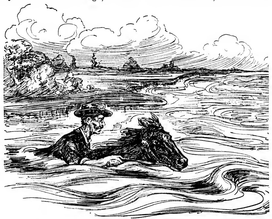
Morris crossed the river at one of its most dangerous points.

The Indian hurried back to his horse and took up the trail and soon discovered that Morris was traveling south, bearing a little to the east and going at full speed. The Indian followed as fast as possible and made good time. Being on a better horse and a better rider, he was cover-