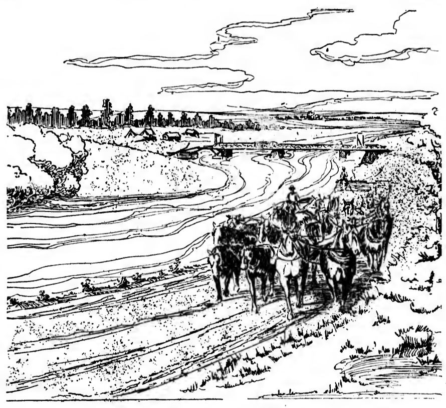
The Bridge Builder's Camp.

as the eye could reach, one of the characters peculiar to the western world, where big men are developed and big things accomplished. "Happy" knew the history of many such men. He had lived the greater part of his life among such conditions and had known of scores of incidents where a poor man had made himself rich beyond description.