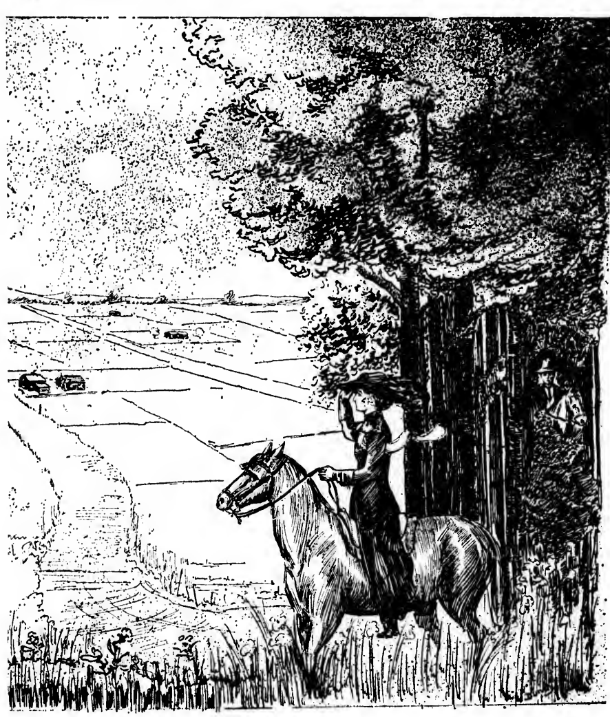
She stopped, and standing up in her stirrups, she raised herself up as high as possible and looked across the country.

It was none of his business where she was going,—perhaps to the home of some settler who was sick that she knew of, or perhaps to stay all night at the