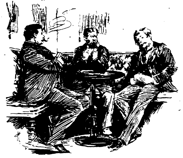
"He played one game. -p. 55