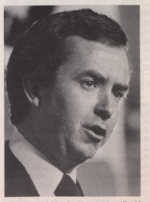
"Our partnership...begins tonight...," said Joe Clark, Prime Minister-elect May 22.

Thirteen Cabinet ministers lost their seats in the election, the largest number in the Toronto area, where all six ministers were defeated. In western Canada,