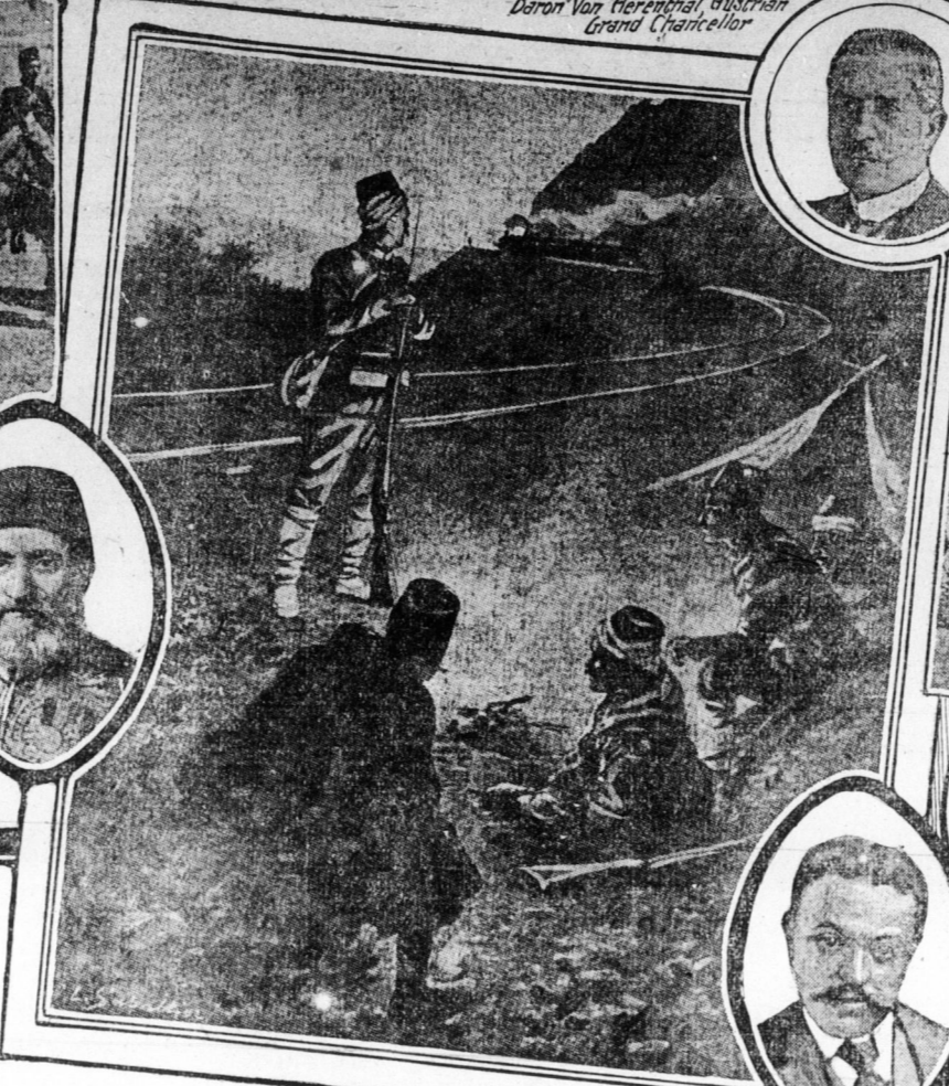
Turkish Troops Guarding Oriental Railroad

In Manitoba, Saskatchewan and Alberta is via Chicago and St. Paul, Minneapolis or Duluth.