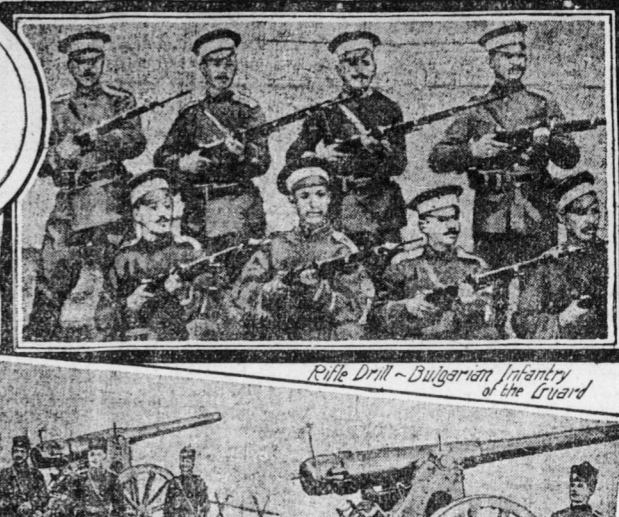
Rifle Drill - Bulgarian Infantry of the Guard

Four Cattle Rustlers Killed Near San Diego, Cal.