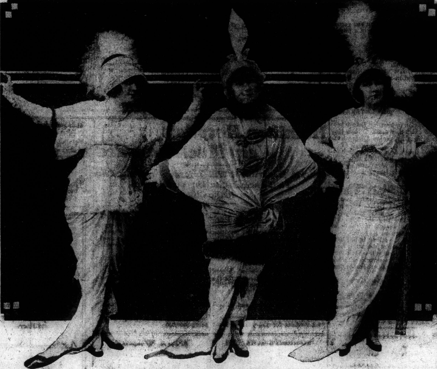
Fannie Ward and Three of Her Remarkable Gowns.

Upholstered furniture may be dry cleaned at home if one will only take time to do the work thoroughly. Mix equal parts of whiting and starch and cover all the soiled surface. Let it remain for a day and place in the sun.