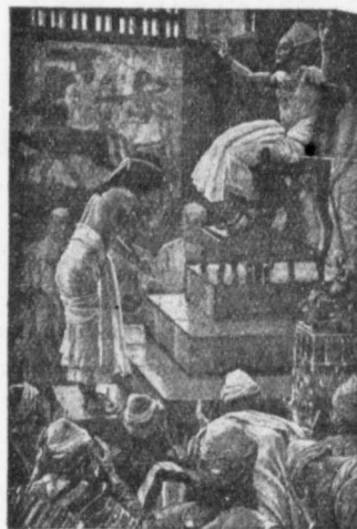
"Joseph and his Brethren welcomed by Pharaoh."