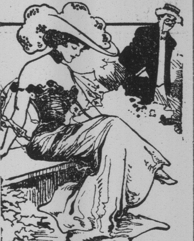
May-What would you do if you had Jim-Try to put up with it.

Already $85,000 has been spent on research and labor in connection with it, and the London County Council, under whose direction it is being prepared, expects a further expenditure of $25,000