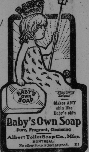
Baby's Own Soap Pure, Fragrant, Cleansing

Owing to change of business, which will continue until the whole new and complete stock ($15,000) has been disposed of. Such Bargains in Ladies' Garments, Ready-to-Wear Suits, Skirts and Coats, we venture to say, have never before been offered in this city. Absolutely no reserve and no two prices. B. MYERS, Dry Goods Store, - - 695 Main Street.