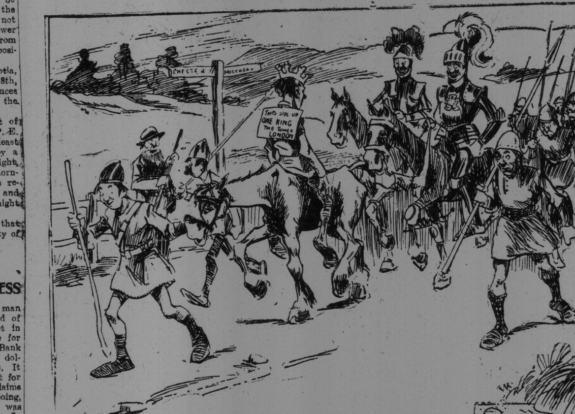
Richard's Trip from Wales to London, Sept. 30, 1399. In 1399 Richard II. led an expedition against the Irish, and, taking advantage of his absence, Henry Bolingbroke, Duke of Hereford, returned from exile. When Richard came home from Ireland, he found himself a prisoner in the hands of the man he had banished. He was led, mounted on a wretched horse, to London, deposed from the throne and lodged in the Tower, where he died mysteriously. Hereford, who was the son of John of Gaunt and the King's cousin, assumed the crown as Henry IV.