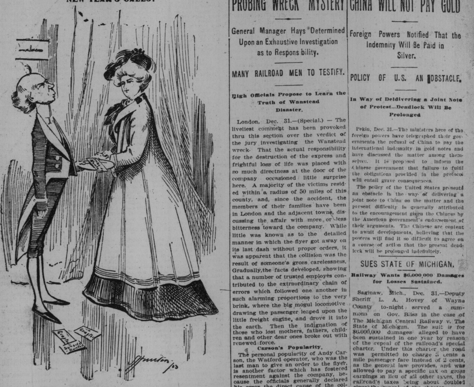
MISS CANADA: (As the grafters and subsidy-hunters send in their cards of a home—Do you understand Not and not receiving this year)

Little Rock, Ark., Dec. 31.—Thirty railroad employes were injured, four perhaps fatally, in a work train wreck at the Fort Smith crossing in North Little Rock. There were three hundred men on the train.