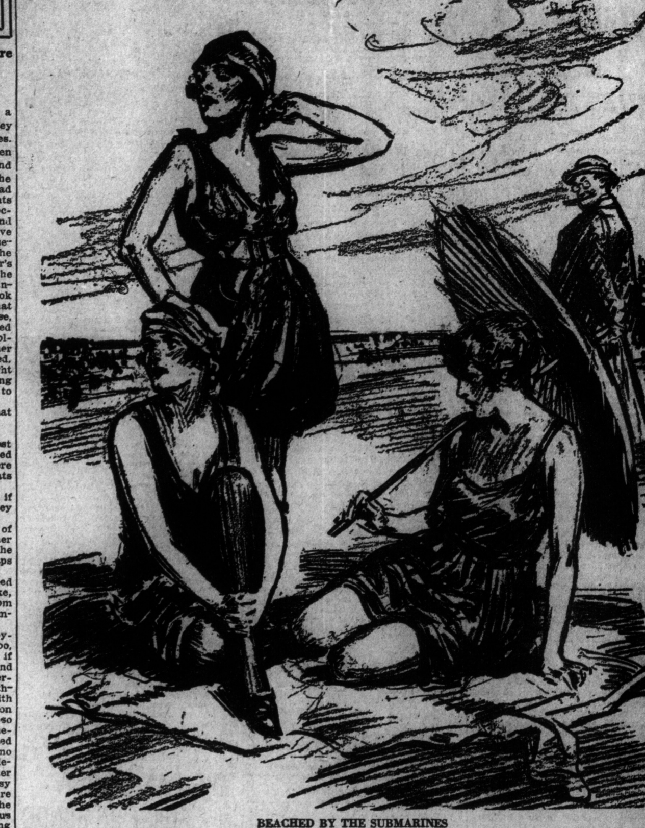
BEACHED BY THE SUBMARINES