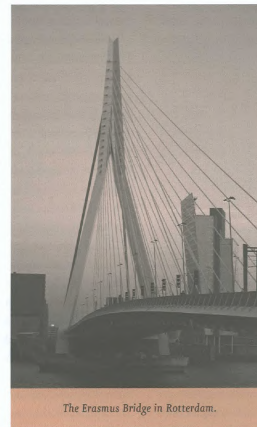
The Erasmus Bridge in Rotterdam.

For more information and to register , visit the Canada Business Day Web site at www.canadabusinessday.nl .