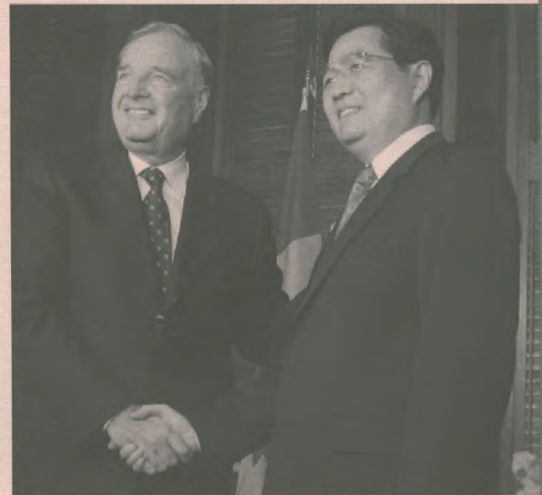
Prime Minister Martin meets with Chinese President Hu Jintao.

The Joint Science and Technology (S&T) Declaration announced during the visit will facilitate cooperative activities between Canadian and Chinese organizations, including the private sector. This is an important step in Canada's discussions with the Chinese on a S&T agreement and these negotiations are expected to be completed by year-end.