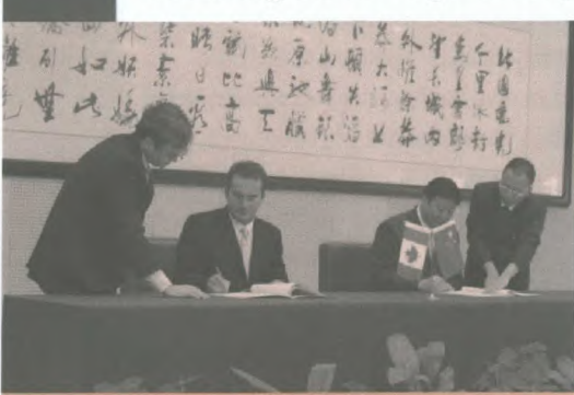
Transport Minister Jean Lapierre and the Chinese Minister of the General Administration of Civil Aviation, Yang Yuanyuan, sign the Memorandum of Understanding on Technical Cooperation in Aviation.

Beijing China > China is the world's fastest growing major economy and has become Canada's second-largest two-way trading partner. A safe, secure and efficient transportation system will be needed to support these growing and important commercial ties. As such, both countries must ensure that their transportation systems are up to the opportunities and challenges of moving an increasing number of goods and people.