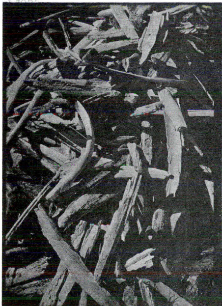
Pile of whalebones at Spence Bay to be used for carving.

The program, which will last from 1975 to 1979, is designed to mitigate the impact of disturbance by today's Eskimos at ancient (Thule culture) village sites. It will attempt to survey the sites, especially those adjoining modern Eskimo settlements where whalebone sculpting has developed, to