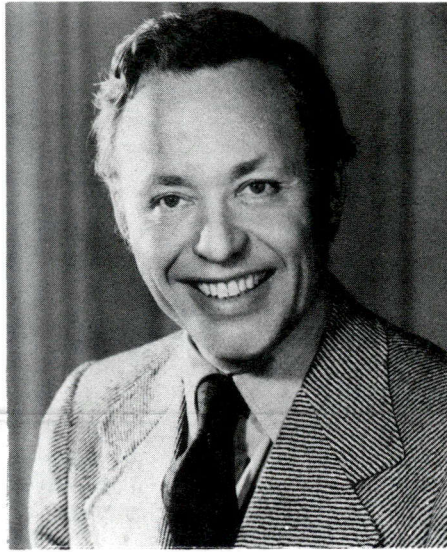
Defence Minister James Richardson

Referring to capital expenditures for equipment, Mr. Richardson said that they would rise in 1976-77 to approximately $460 million from the currently forecast figure of $334 million in 1975-76.