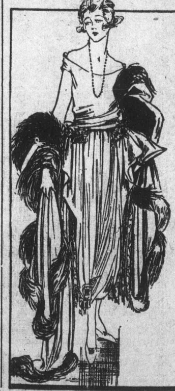
Autumn model in topaz yellow taffeta, ochre lace and purple-and-silver glace

The skirt of this dress is almost ankle-length. "Almost, but not quite." This is the latest idea in the rue de la Paix. All through the Paris dressmakers clung to the ultra