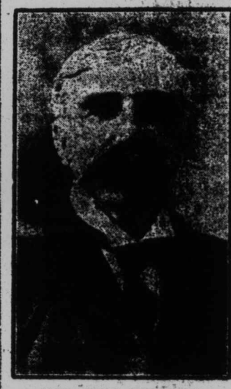
HON. JOHN MORRISSY Minister of Public Works

immense throng passed over and returned to the Newcastle side.