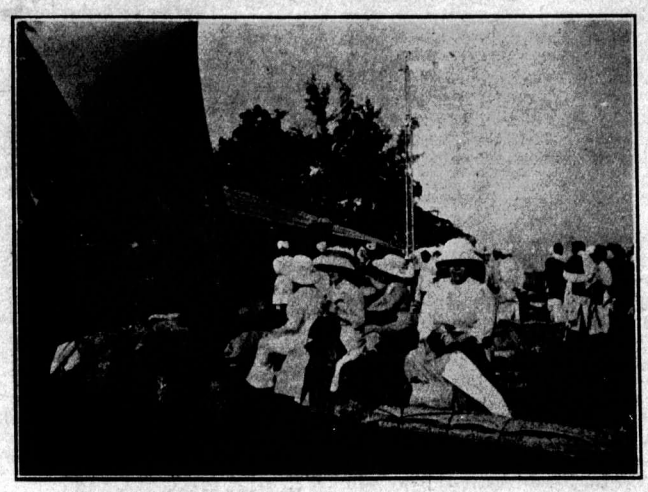
A GROUP OF MISSIONARIES AT THE STATION IN COCANADA.

out retort' she would say and very often exhibited much of His spirit of meekness in her sufferings. Jesus was very real to her and prayer to Him her solace.