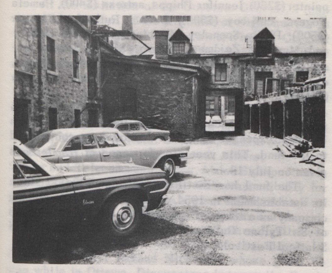
Condition of Stables before the restoration work started.