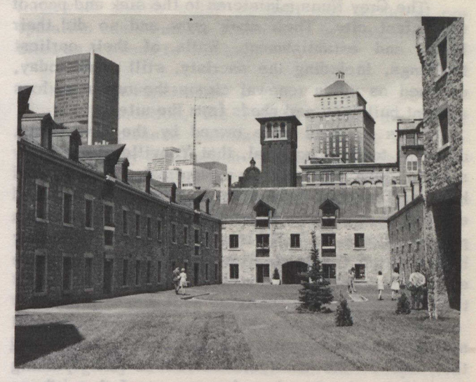
Youville Stables today. Old World architecture accommodates modern enterprises.

In one wing of the complex a quality restaurant will serve not only tenants and neighbors, but tourists